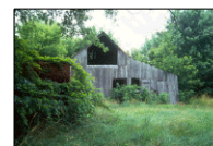
Barn on Military Donation No. 10