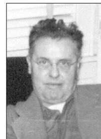
George Nelson Field