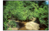
Mountain Run, Culpeper County, Virginia