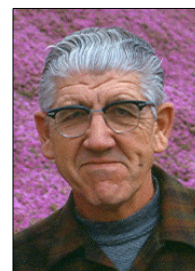
Howard Allen Field