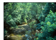
Mountain Run, Culpeper County, Virginia