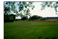
Kentucky land near Salt River