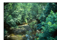
Mountain Run, Culpeper County, Virginia