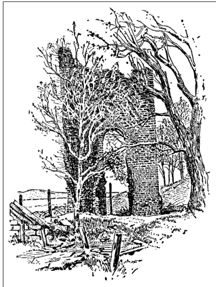
The Tower of the Church in Jamestown VA