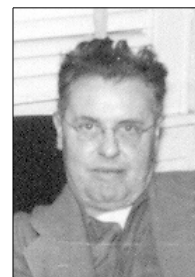
George Nelson Field