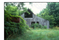
Barn on Military Donation No. 10