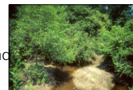
Mountain Run, Culpeper County, Virginia