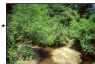
Mountain Run, Culpeper County, Virginia