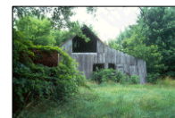
Barn on Military Donation No. 10