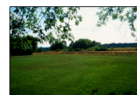
Kentucky land near Salt River