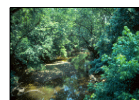
Mountain Run, Culpeper County, Virginia

General Notes: One of the first Justices in the Orange County Court